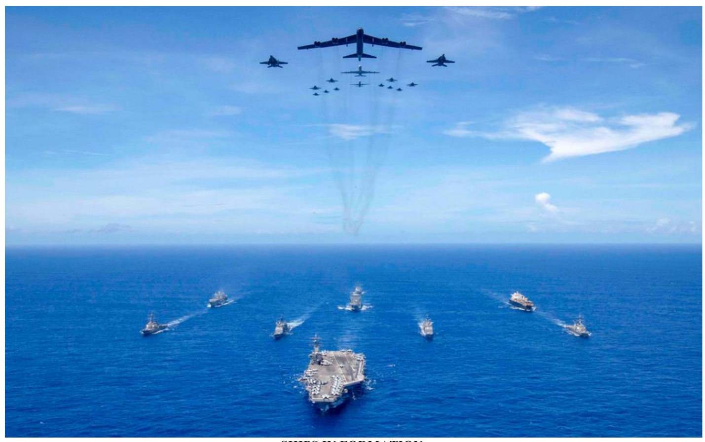
SHIPS IN FORMATION

The aircraft carrier USS Ronald Reagan leads a formation of ships assigned to Carrier Strike Group 5 as Air Force B-52 Stratofortress aircraft and Navy F/A-18 Hornets pass overhead for a photo exercise in the Philippine Sea, Sept. 17, 2018, as part of V.