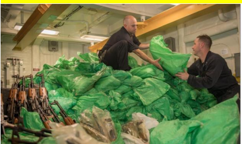
U.S. sailors stack AK-47 automatic rifles aboard the guided missile destroyer USS Jason Dunham in the Gulf of Aden, Aug. 30, 2018. The ship's visit, board, search and seizure team seized the weapons from a skiff during a flag verification boarding as part of maritime security operations.